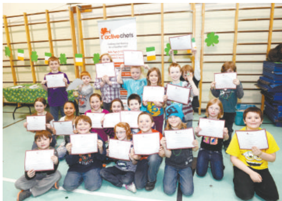
Students at J.M. Denyes School show their certificates last week after completing the ActiveChefs program, a not-for-profit initiative aimed at empowering children to make healthier lifestyle choices. The program — which has been brought to 5,000 students at over 60 schools — emphasized healthy eating, active living, multiculturalism and family engagement.